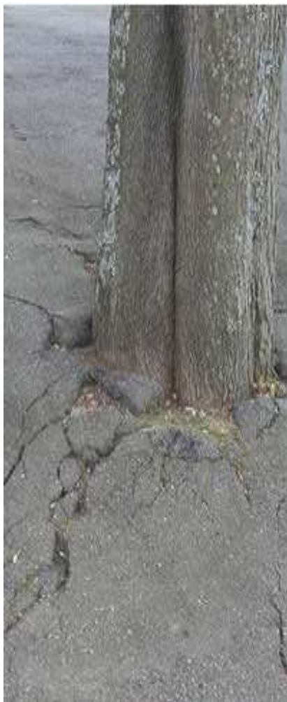
Plant wedging of macadam driveway. Urban bioturbation?

It looks exciting, no? But we still have to be patient to meet there. The location of the Conference: 58° 14.984'N, 11° 26.737'E